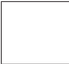
Seal of the Board